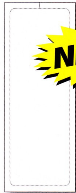
4 1/4" x 11"