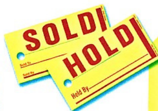
Form #855 2-3/8" x 4-3/4"