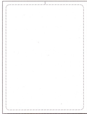
8 1/2" x 11"